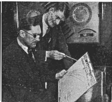
George Eyston snapped on the Ferodo Stand at Olympia on the eve of his departure for Monthéry with the Magic Magnette.

For particulars of George Eyston's recent records at Monthéry see page 528.