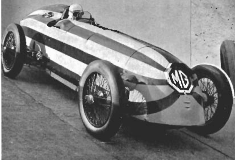
A close-up of the Magic Magnette.