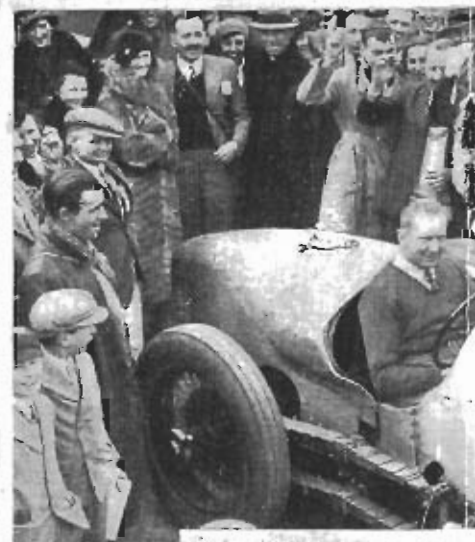
John Cobb, popular hero, after raising the Brooklands record to 139.71 m.p.h. on