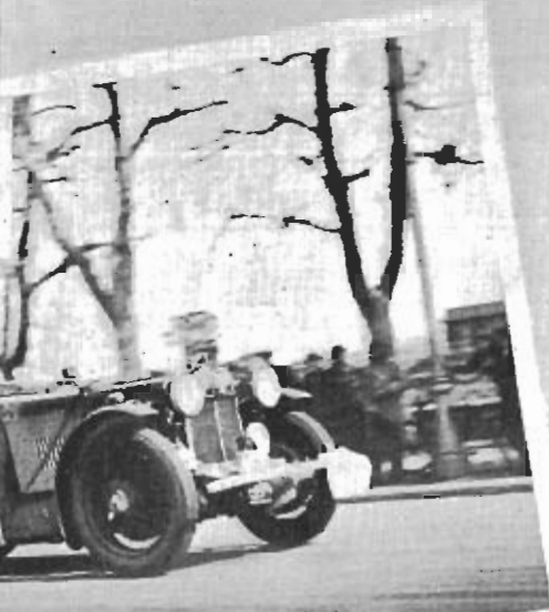
Miss Riddel at speed.