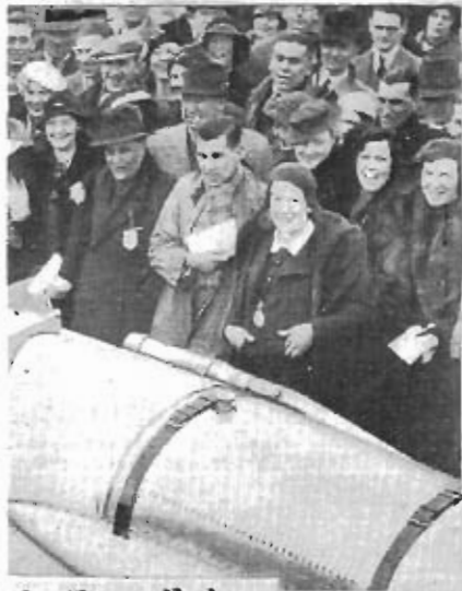
In his Napier Railton sets lap record to beater Monday.