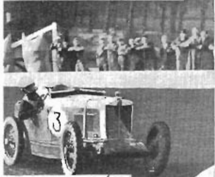
this country! the Crystal Palace is skid which took ack.